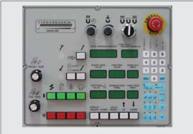
■ Type AD5 Automatic Downfeed Control Panel (Opt.)