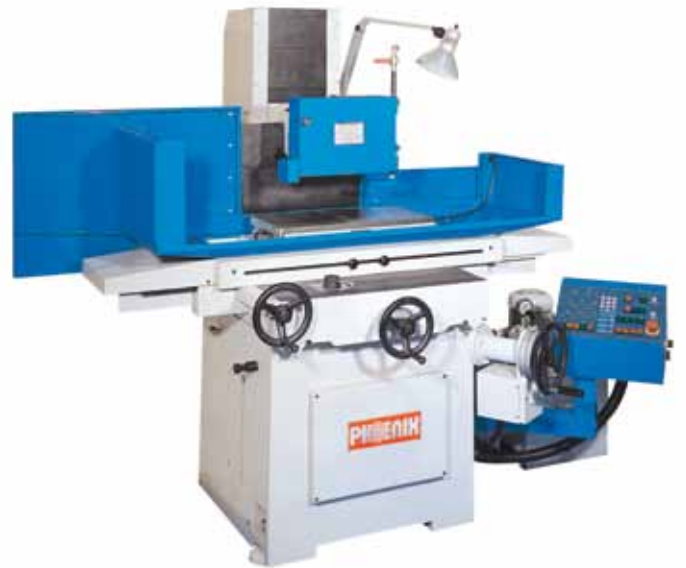
FSG-DL3060AH ▲ ■ w / Type AD5 Auto Down Feed Control (Opt.)